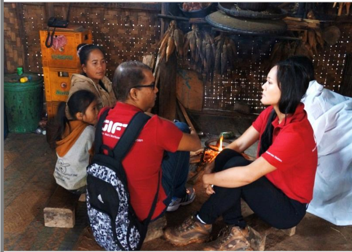
Top : Participants enjoy a traditional lunch cooked by the villagers of Ban Phakeo.