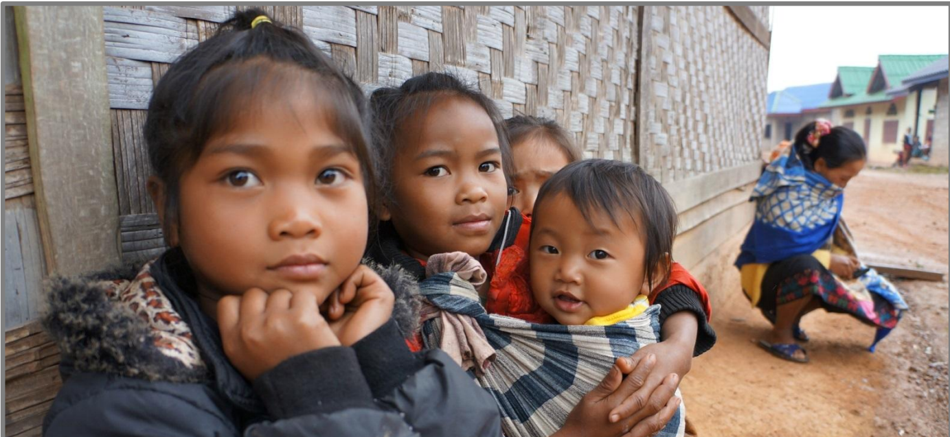
Curious children in Ban Phakeo village come to see the group.

The village of Ban Phakeo is situated in the mountainous region of Luang Prabang Province and is home to 86 households. Villagers rely on subsistence farming, living primarily off locally produced rice, vegetables and mushrooms. Ban Phakeo has its own hybrid solar/diesel-power grid, funded by the French NGO, Fondation Energies pour le Monde and set-up by Sunlabob in 2009. Ban Phakeo is currently being connected to the national grid.