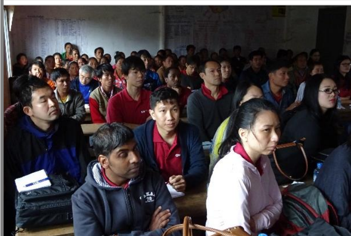
Bottom left: participants gather in the village hall for an introduction by village and provincial officials.