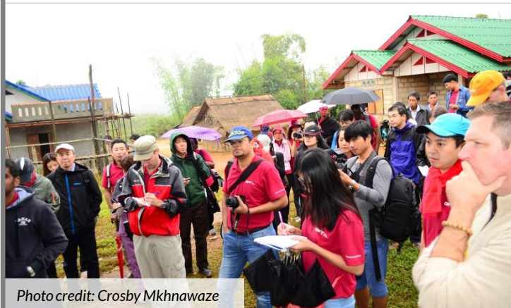
Bottom: the group visits the solar power station in Ban Phakeo village.