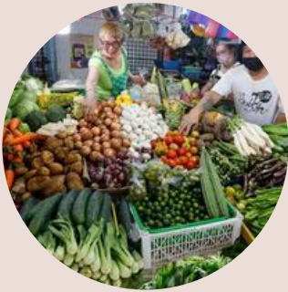
Revitalising Malaysia's Agri-Food Industry: Path to Food Security

The project will focus on revitalising the agri-food industry towards the creation of a nation with sustainable food security. Participants will be invited to develop robust policy recommendations and practical business ideas that will help create a vibrant and self-sufficient agri-food ecosystem in Malaysia.