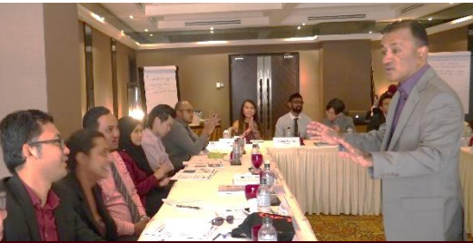
Classroom-based learning (3 days)

Focused on the implementation of practical pilot schemes and initiatives, the MS&B programme consists of 8 days of intensive learning, questioning, collaborating, ideating and designing.