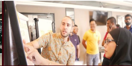
Producing proposals & action plans (2 days)