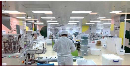
Site visits & stakeholder engagements (3 days)