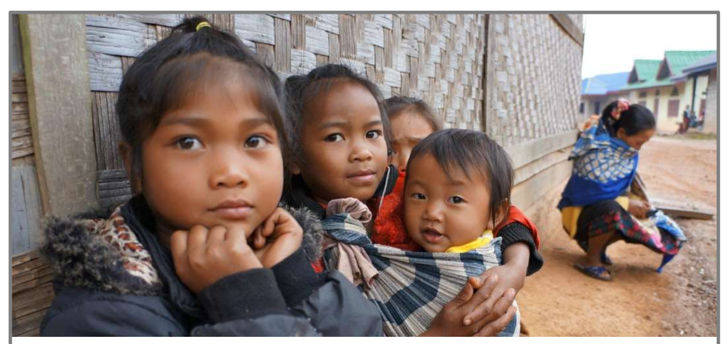
Curious children in Ban Phakeo village come to see the group.

The village of Ban Phakeo is situated in the mountainous region of Luang Prabang Province and is home to 86 households. Villagers rely on subsistence farming, living primarily off locally produced rice, vegetables and mushrooms. Ban Phakeo has its own hybrid solar/diesel-power grid, funded by the French NGO, Fondation Energies pour le Monde and set-up by Sunlabob in 2009. Ban Phakeo is currently being connected to the national grid.