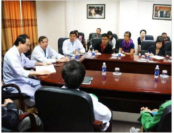
Participants speak with the management team and head doctors at Vietnam's national hospital for Pediatrics and Neonatal care

After several days speaking with the management of EMW and MTTS alongside distributors, hospital administrators and the local community, the participants identified several key areas that were limiting MTTS' competitiveness and opportunities that it had not yet taken advantage of. Firstly, MTTS' low sales volume meant high production costs and low margins. There was also the lack of a commercial culture in the company, with MTTS' sole salesperson having been hired in 2014.