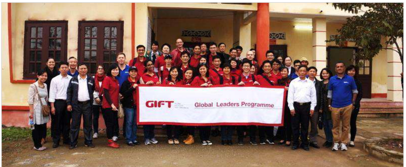
GLP participants, the GIFT team and community representatives outside the town hall in the Dong Son district

The participants presented their findings at a final forum attended by over 70 interested parties including senior leadership from NEC, Draeger Medical and East Meets West and representatives from the finance, medical and NGO sectors such as ORIX, Becton Dickinson, TC Capital, Siemens, LGT Venture Philanthropy, and Save the Children. Also in attendance was the Chairman of the Vietnam Medical Equipment Association whose interest in MTTs, whose existence he had not been aware of, was both a sign of the work that still needed to be done to promote their work but also the opportunity that existed for very significant future growth and social returns.