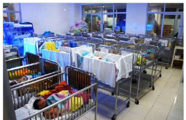
Neonatal intensive care unit at the C hospital in Hanoi