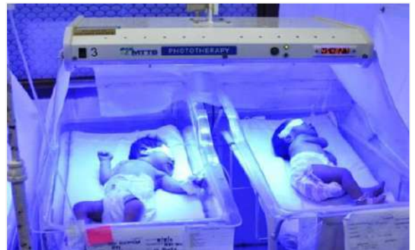
MTTTS' overhead phototherapy unit used to treat infants with jaundice