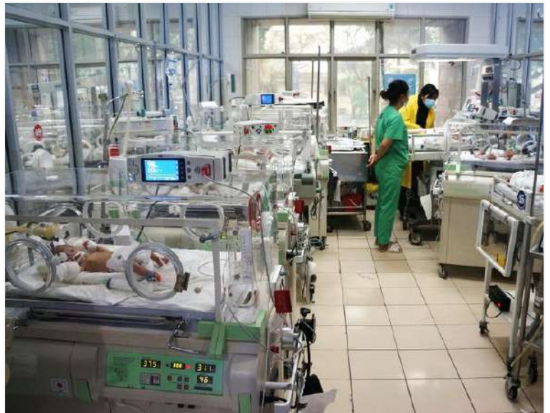
Neonatal intensive care unit at the C hospital in Hanoi

MTTS' goal is to take modern medical technology and 'transfer' it to hospitals in the developing world by making it affordable, durable and easy-to-use.