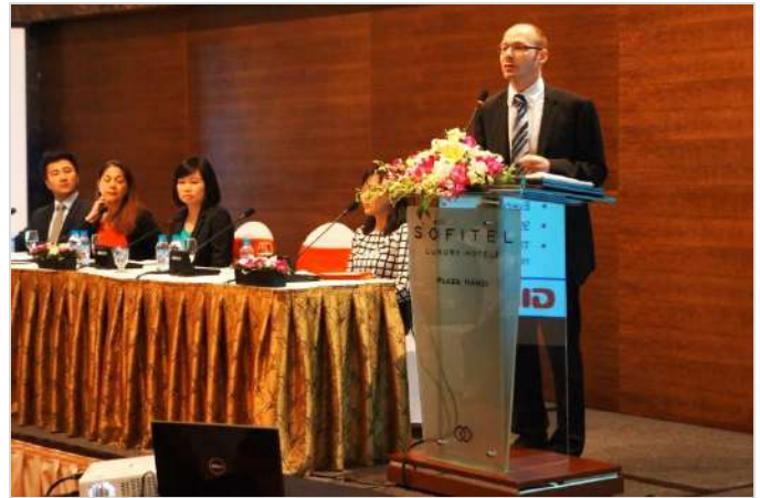
Participants present their recommendations at a forum attended by industry representatives and investors

Were MTTs to move their base of production to the Philippines , where both rent and shipping would be cheaper and a larger pool of technical talent would be available, they could further reduce costs and invest in human capital. And by identifying strategic partners in different industries, MTTs could expand its product portfolio, benefit from low-cost purchasing deals and distribute its products in markets it has no physical presence in. If MTTs were to secure the necessary financing to implement these changes within the next year, it could very well increase its sales to US$30 million by 2019.