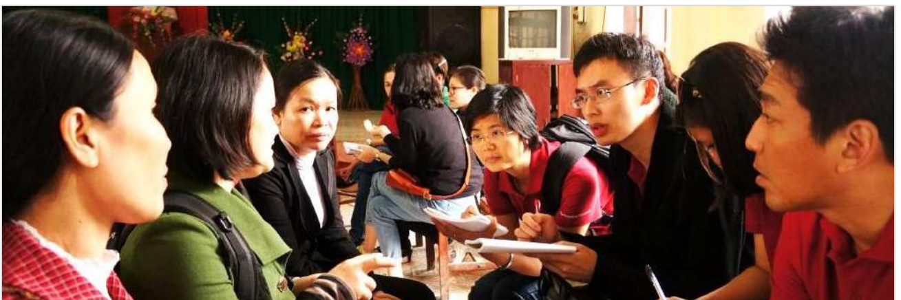
At a meeting with leaders of the Dong Song district women's group to discuss their healthcare needs

The participants' proposal to MTTS was therefore to build on its existing but small presence in neighbouring countries and expand and focus their operations outside of Vietnam , starting with the 600 million population of ASEAN and eventually moving into the rest of Asia and Africa. The economies of scale that would arise from the far larger market (US$30 million versus US$2.5 million) would lower MTTS' cost of production and increase sales to the point where they would be able to hire and train a larger sales force.