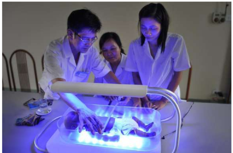
Medical staff testing MTTs' Firefly unit to treat jaundice

Participants came from a multitude of countries, cultures, companies and organisations including BASF, ORIX, BSN, APG Asset Management, NEC, Origin Energy, Maybank, WISE, Becton Dickinson, Mother's Choice, Seven Bank, MasterCard, China Light & Power and the Hong Kong government. They would have to learn to communicate and work both with each other and in an unfamiliar country effectively enough to produce a useable output.